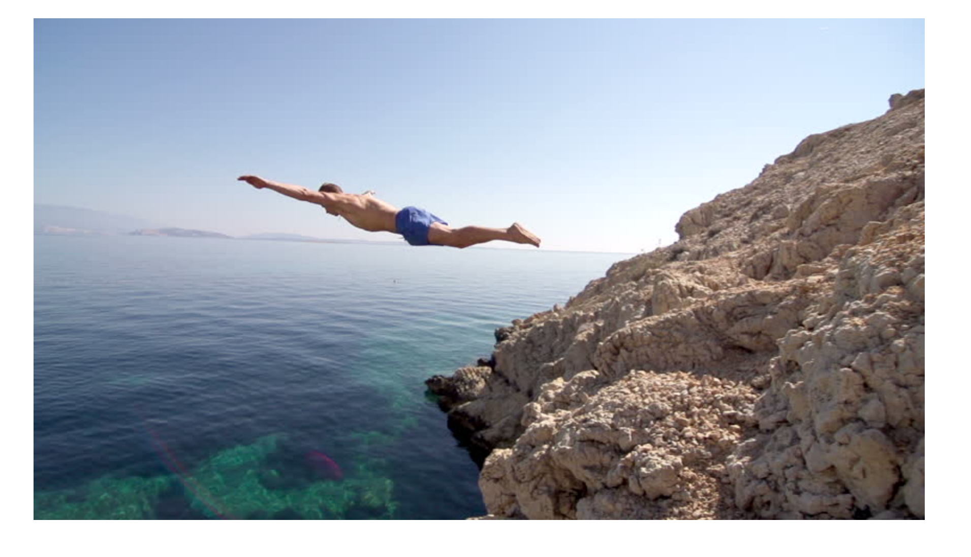
God accepts us anyway